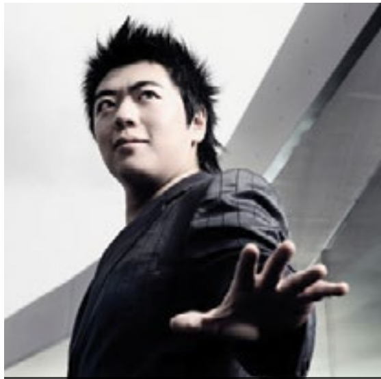
Pianist Lang Lang, Green Music Center Opening