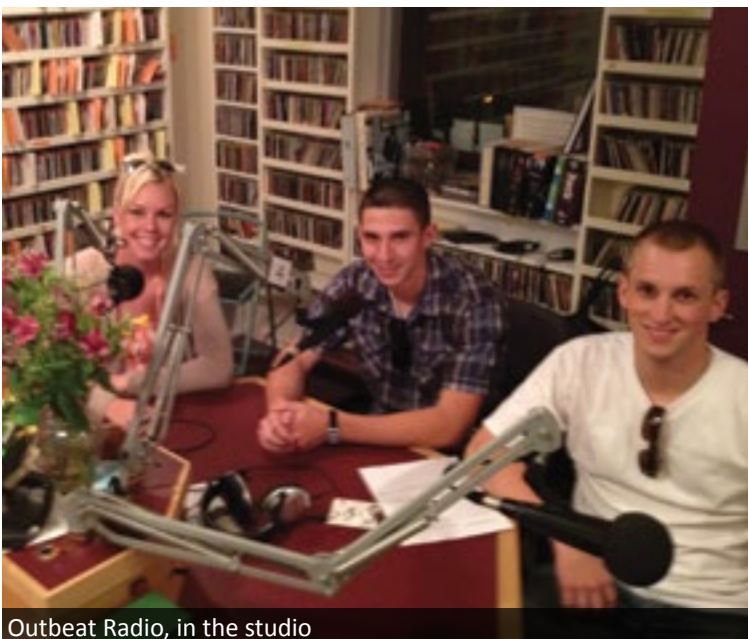
Outbeat Radio, in the studio

striding onto the stage and speaking for more than an hour about the Democracy Now! coverage of the 2012 presidential campaign. After signing books and speaking to every person on the long line of admiring fans, they were off to their next event, scheduled to begin in two hours.