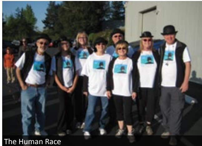
The Human Race