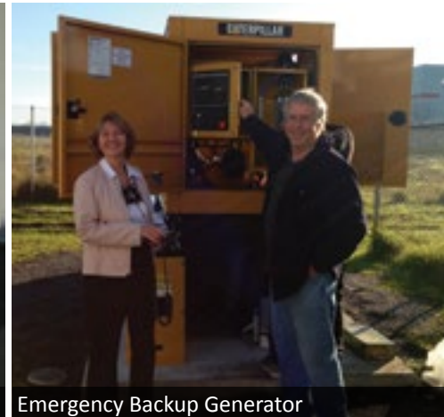
Emergency Backup Generator