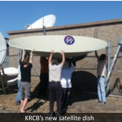
KRCB's new satellite dish