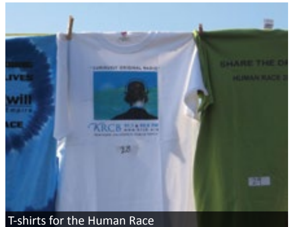
T-shirts for the Human Race

A dedicated delegation of KRCB staff members and volunteers from KRCB donned their matching T-shirts and joined the annual Human Race in May. The event, sponsored by the Volunteer Center of Sonoma County, is a major fundraiser for numerous local non-profits. The money raised by this team will come back to benefit KRCB.