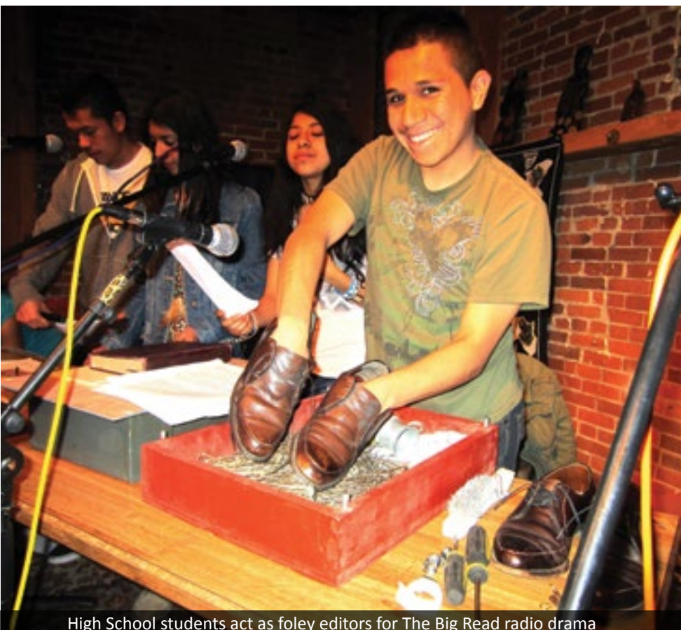
High School students act as foley editors for The Big Read radio drama

KRCB, along with the Sonoma County Museum and Santa Rosa High School participated in the National Youth Summit featuring Ken Burns' latest film, The Dust Bowl . The National Youth Summit is designed to convene a national discussion where scholars, teachers, activists and students can engage in a discussion about important historical events that have relevance to contemporary issues facing Americans. Held at Santa Rosa High School, the project included viewing the film, asking questions of the filmmaker, and a panel of local experts discussing environmental issues closer to home. Our discussion revolved around the proposed nuclear power plant at Bodega Head, and what might have been had that plan been approved. This topic will also be the subject of an exhibition at the Sonoma County Museum planned for 2013 or 2014.