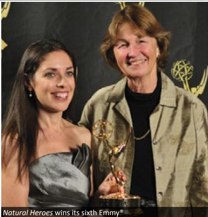
Natural Heroes wins its sixth Emmy®