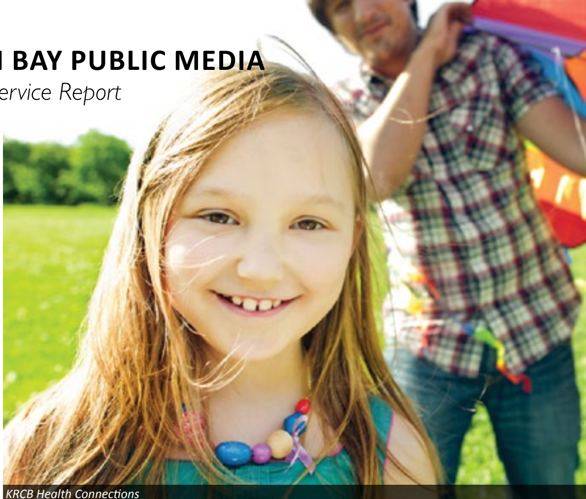
KRCB Health Connections

2012 has seen continued progress on the KRCB North Bay Public Media path to community collaboration and sustainability. The knowledge that we must grow our local unique and important services with our many community partners has informed and directed many of our activities. The full Local Content and Service Report which follows details much of this work. Here, however is a brief summary.