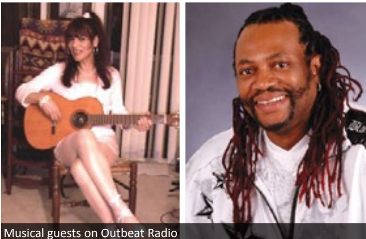
Musical guests on Outbeat Radio