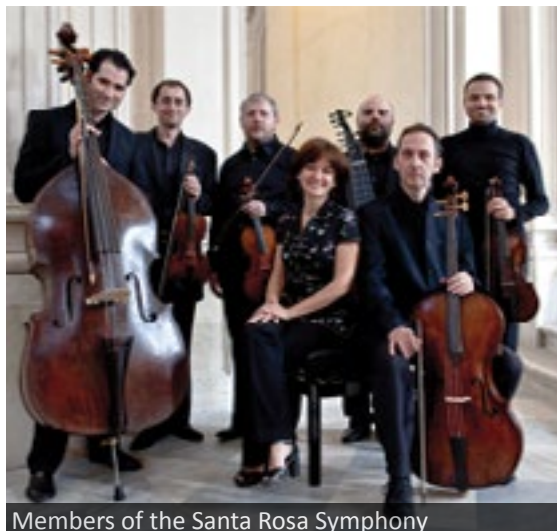
Members of the Santa Rosa Symphony