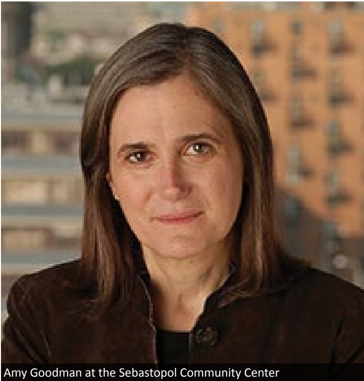
Amy Goodman at the Sebastopol Community Center